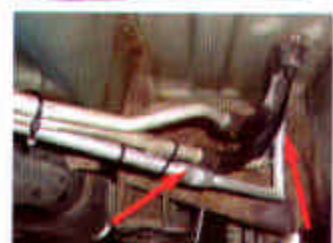
Close-up of repaired lines.