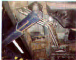
Mini Van Rear refrigerant and coolant lines.