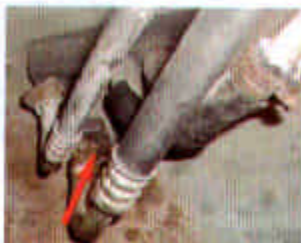
Leaking refrigerant lines at spring lock connection.