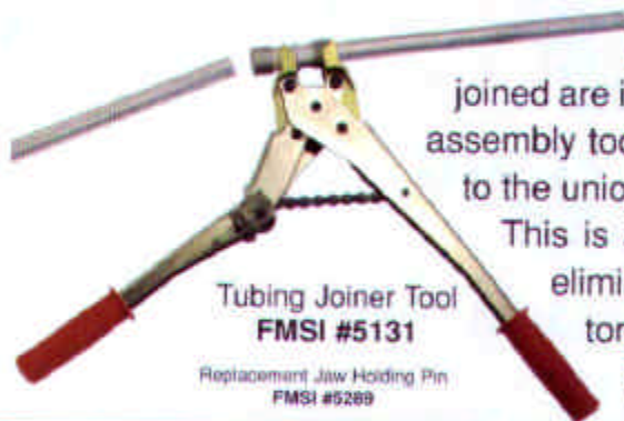
Tubing Joiner Tool FMSI #5131